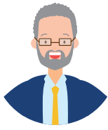
Certified Scrum Product Owners (CSPOs)