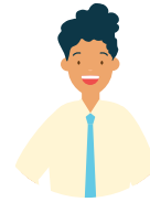
Managers Software Development