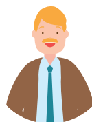
Development team members