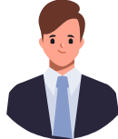
Software development managers