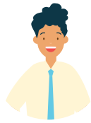
Scrum team members