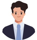
Team Leads/ Team Members