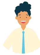
Product Managers and Product Owners