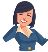
SAFe Practice Consultants