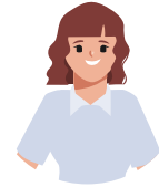
Program or Project Managers