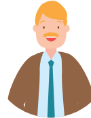
Solution Train Engineers