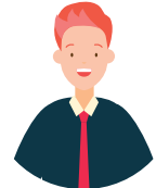
Professionals transitioning from ITIL 3 to ITIL 4