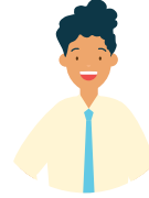
Program and Project Managers