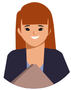
Release Train Engineers